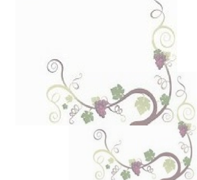
Apríl 2023 Vol 1, Issue 6